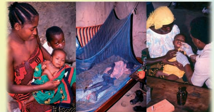
Children having Malaria injections, Treated Nets