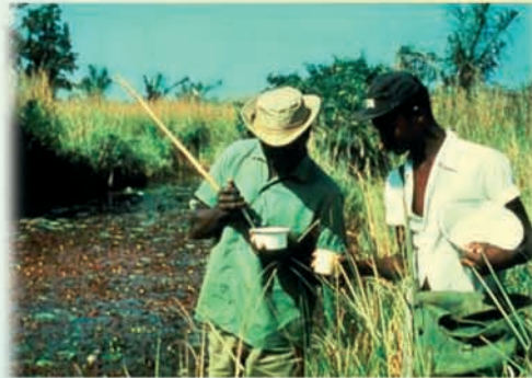
Collecting larvae in a swamp area

It was first described in writings as long ago as 2,700 BC